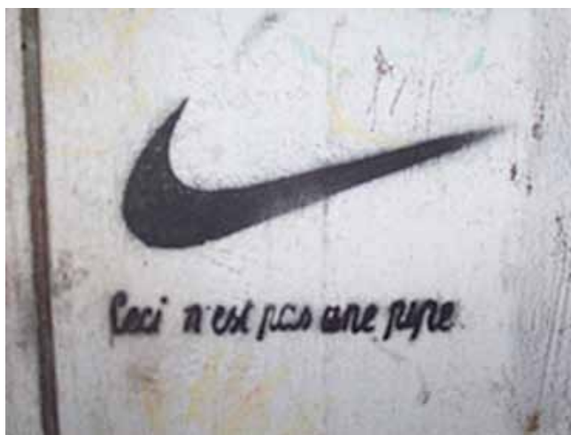
Fig. 2 - Anonymous

Poetic transit-translation involves a series of layers or levels which affect its temporal condition. If we interpreted it diachronically, we would only access its logical-grammatical value. Although returning again to Heidegger, the hermeneutical perspective rivals the synchronic perspective, since "the true past has no way back" (Leyte, 2013: 230), unlike the diachronic perspective, it cannot be repeated.