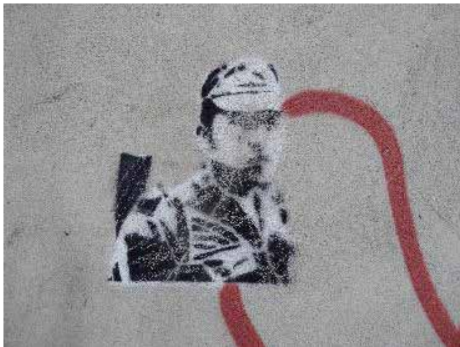
Fig. 8 - Anonymous, [Salgueiro Maia] (Almada, 2013)