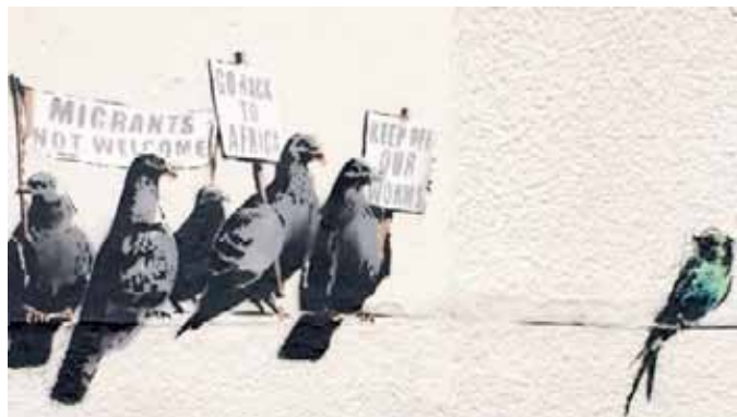
Fig. 2 - Anonymous

In this pure language — which no longer signifies or expresses anything but rather, as the expressionless and creative word that is the intended object of every language — all communication, all meaning, and all intention arrive at a level where they are destined to be extinguished. And it is in fact on the basis of them that freedom in translation acquires a new and higher justification. (1997: 162-163)