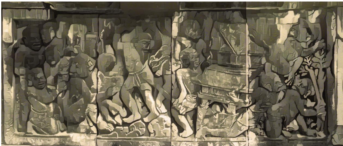
Figure 3: An Edited Version of the Slate with a Warmer Effect to Create A More Dramatic Emotion.