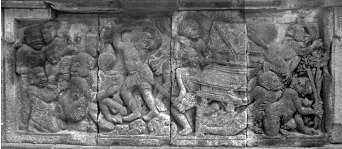
Figure 1. Original Slates of the Prambanan Temple Wall Carving Depicting Hanuman Setting Ravana's Demon Village on Fire.