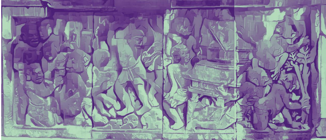
Figure 4: A Slate with Multiple Color Effects and Sharper Lines to Evoke Different Moods And Emotions for Better Understanding.